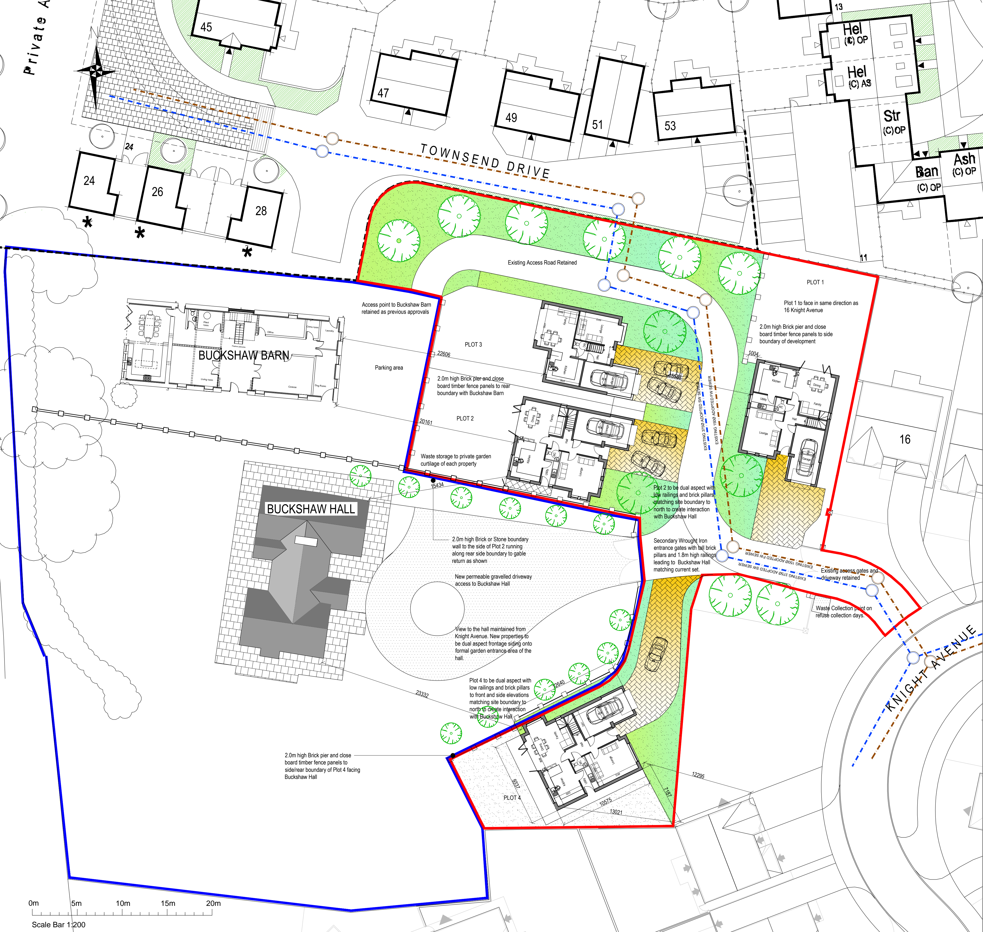
Proposed Site Plan - Scale 1:200